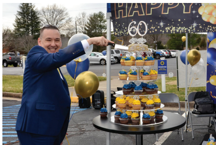
Patrick & Henry Community College's 60th Birthday Celebration!